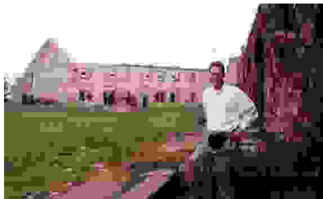
Berg Gleichen near Gotha.