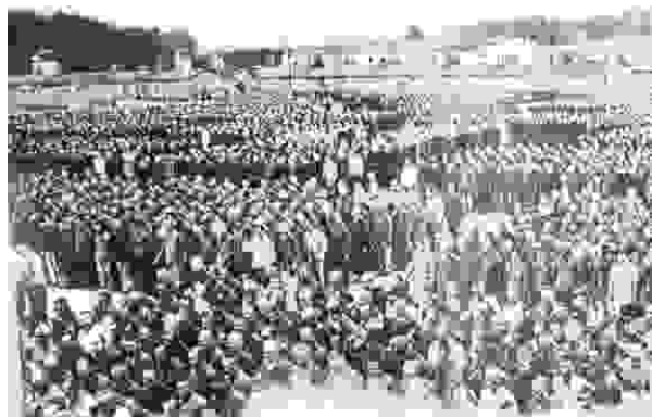
3 Prisoners at Buchenwald.

Weimar is also infamous as the city associated with