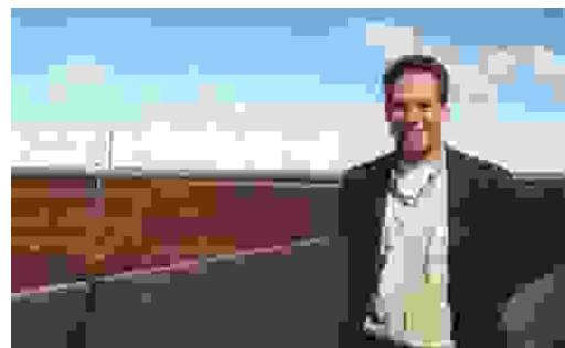
The author tilting at windmills.

Bach lived in Cothen (pronounced Curtin) for several years. He worked for Prince Leopold at the castle, and wrote the Brandenburg Concertos here. Cothen has narrow, cobble stone streets that snake between charming houses with colorful flower boxes. At the Bach museum in the castle, the curators made us put on huge fussy gray slippers over our