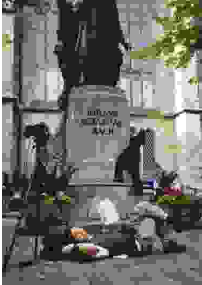
Hard at work in Leipzig.