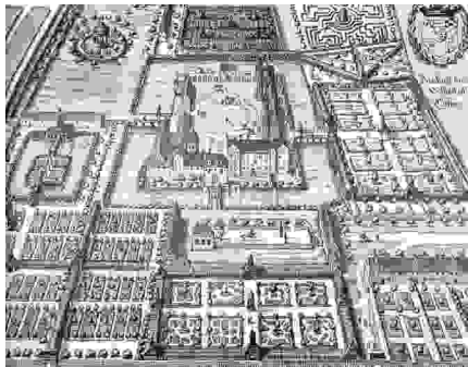
An 18 th century engraving of Cothen.

Fighting jet lag, we walked for a long time looking for a restaurant. I finally recognized a place we used as a location for shooting the video, "Opening the Door to Luther" several years before. The Christofel décor is a cross between new age and the Middle Ages. We had a hearty German meal of meat a potatoes while listening to recorded Monks singing American pop songs. Then, it was a taxi cab ride back to our house for a well deserved nights rest.