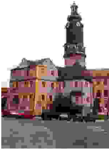
The castle in Weimar.

shoes to protect the floor. You have to slide around like a cross country skier. The museum, inside the castle walls, is full of Bach artifacts including period instruments and paintings.