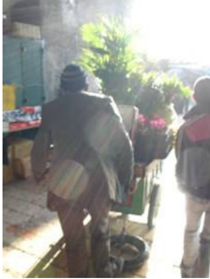
A man pushes a flower cart in the Old City. Note the rubber tire used as a brake.

January is the rainy season in Jerusalem. We ducked for cover as a cold, grey downpour made the brown Jerusalem paving stones slippery and treacherous. The Arab Quarter of the Old City is exotic. The streets are narrow and twisted. Merchants pushing carts crammed with flowers, clothing, electronics and raw meat (eyeballs still in place), work their way through the crowds.