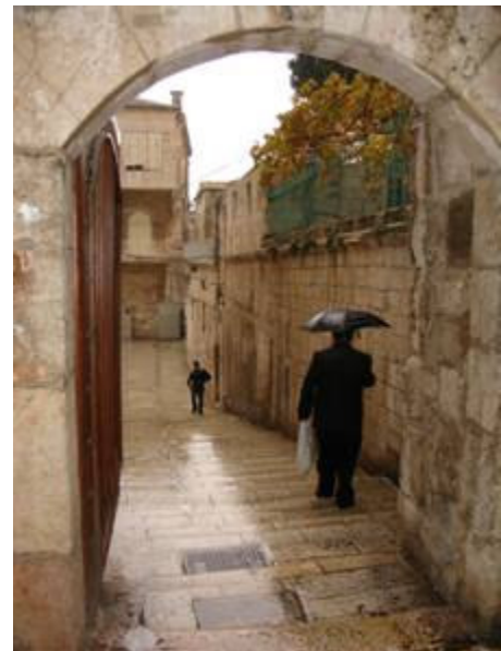
Jerusalem in the rain.

When you rent a car in Israel, the rental car company won't let you drive it through the Occupied Territories. Since several Jesus sites are in the West Bank, we decided to rent a Palestinian car. The Palestinians don't care where you drive the car, as long as you bring it back. Green Peace Car Rental Company has a nice, safe sounding name. They even agreed to bring the car to our hotel. The aging Chevrolet was a death trap, loaded with many dents and dings. The interior was cracked and worn. The engine sounded like it was about to throw a rod. Even the Chevrolet logo on the trunk was missing the last few letters. It now formed the word "Chev."