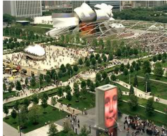
Millennium Park, Chicago