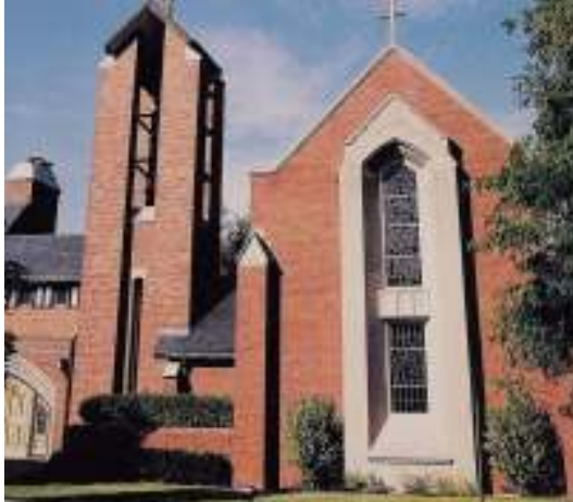
St. Mary's, 306 S. Prospect Ave., Park Ridge

SAINT MARY'S EPISCOPAL CHURCH. The location of for the 2008 Episcopal-Lutheran-Methodist Eucharist is Saint Mary's Church, within three blocks of the Park Ridge town center. It is a beautiful brick building representing the richness of the Anglican tradition. The stained-glass window over the altar depicts the annunciation and was made in London. The sanctuary has seating for 275.