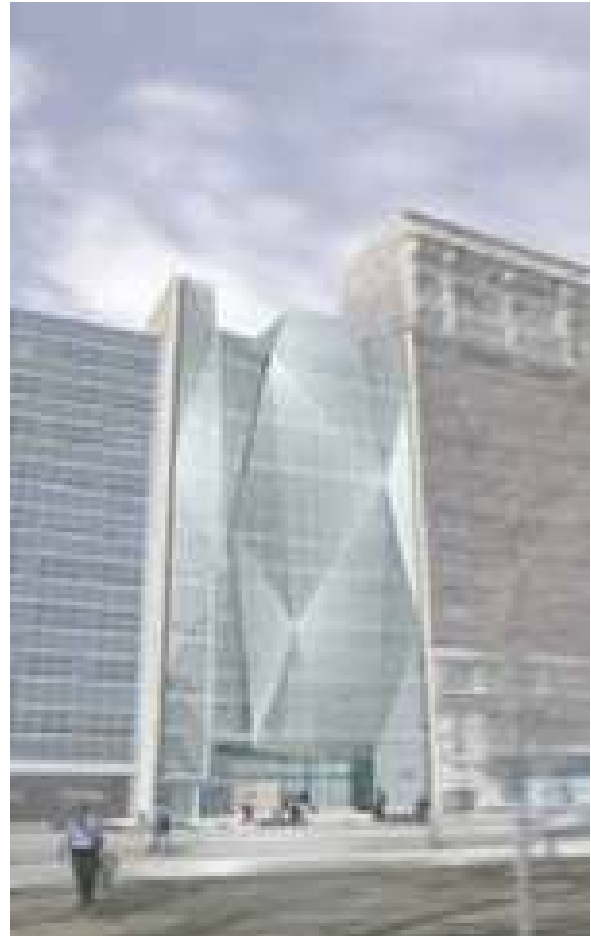
Spertus Institute, 610 South Michigan Avenue