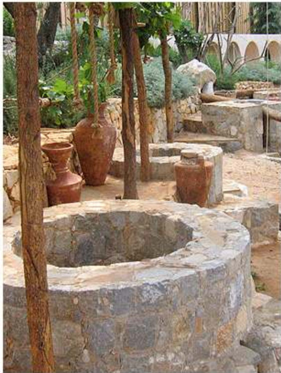
Explorations in Antiquity Center, LaGrange, Georgia